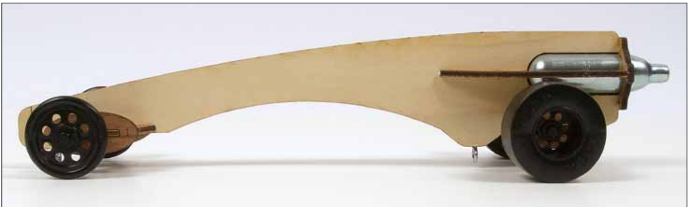
A completed EZ Build Dragster.