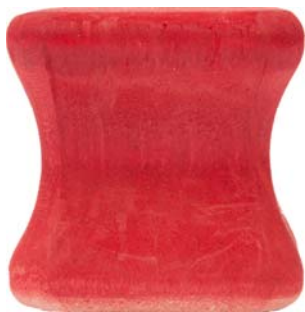
Ordnance (wooden block)